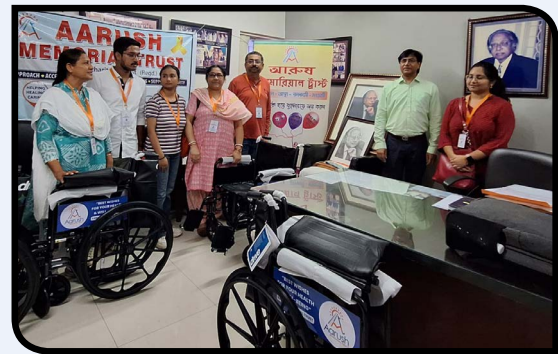
Wheel Chair Donation- SGCCRI Kolkata