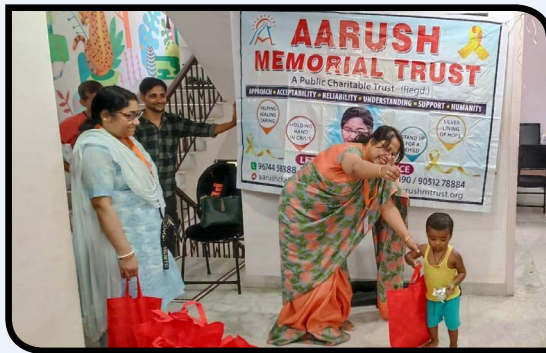
At Snehoneer Kolkata