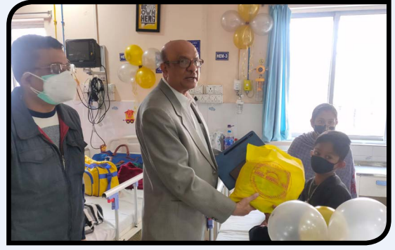
Institute Of Child Health, Kolkata