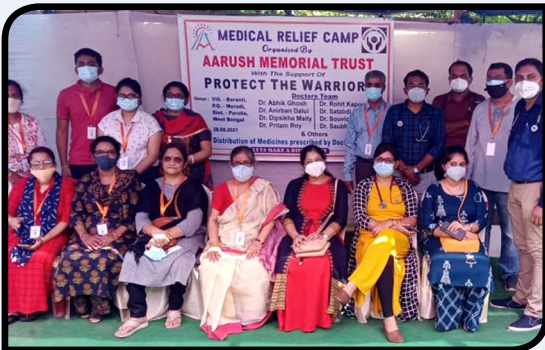
Protect The Warriors