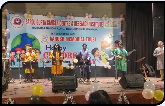
Saroj Gupta Cancer Centre And Research Institute, Kolkata