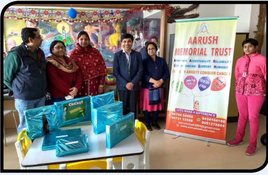
Tata Memorial Centre, Kolkata