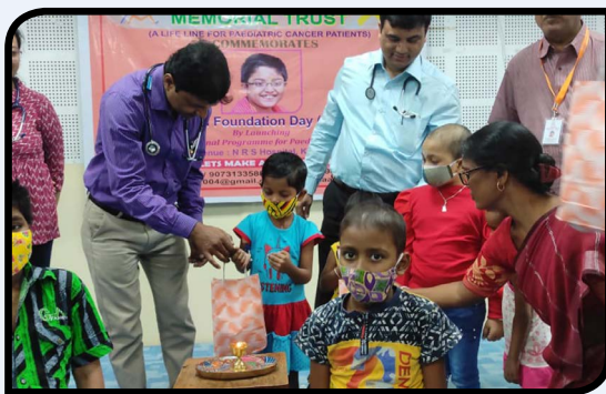
4th Foundation Day - NRS Kolkata