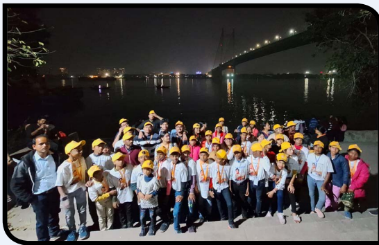
Educational Cum Excursional Tour