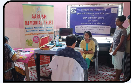
Eye Camp At Aashiyana Happy Home, Kolkata