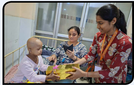
Childhood Cancer Awareness Month- ICH Kolkata