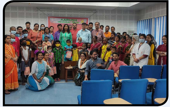
NRS Hospital, Kolkata