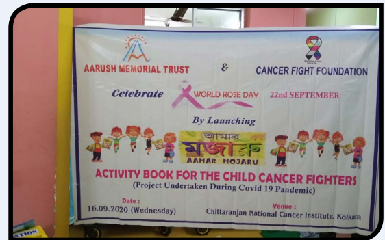
Cancer Fight Foundation